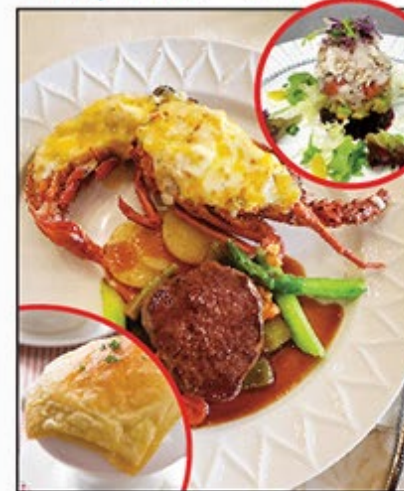
西式宴會 Classic Banquet

Starting from Tuesday, 14 September - 28 October