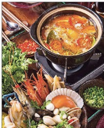
一人一爐自助火鍋 Individual Hot Pot Dinner Buffet

Starting from Monday, 18 October - 30 November