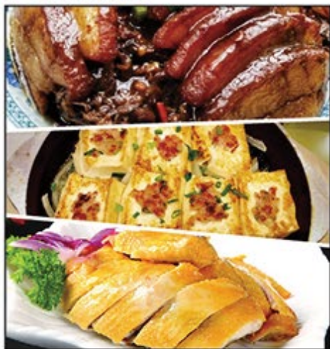
客家美食坊 Hakka Cuisine

Starting from Monday, 18 October - 30 November