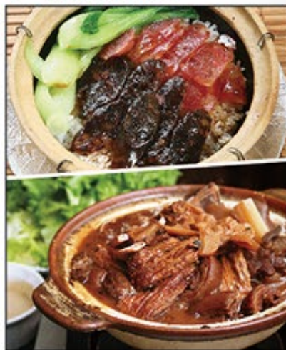
秋冬佳餚篇 Winter Delicacies

Starting from Wednesday, 3 - 30 November