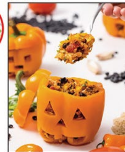
萬聖節晚餐 Halloween Dinner Set