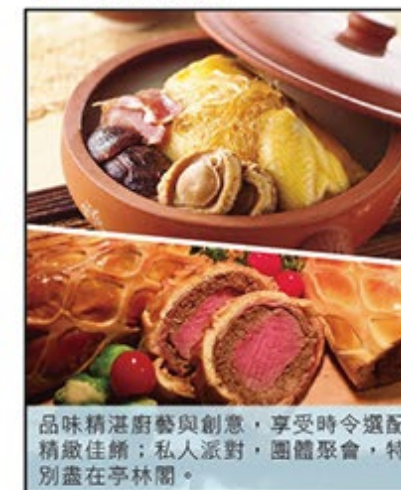
創意酒席(中西合璧) Banquet of Culinary Innovation

All Year Round Advance Order Menu 全年預訂供應