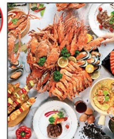
大除夕美食半自助晚餐 New Year Eve Semi-Buffer Dinner

All Year Round Advance Order Menu 全年預訂供應