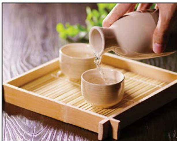
中西佳餚清酒晚會 Chinese, Western Cuisine Sake Tasting Dinner

Starting from Wednesday, 8 - 31 December