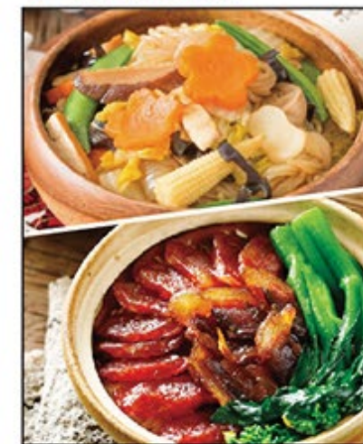
冬日滋味煲仔飯 Casserole Rice Suggestion

Starting from Friday & Saturday, 24 & 25 December