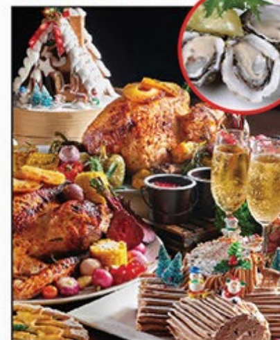
平安夜及聖誕節自助晚餐 Christmas Eve & Christmas Dinner Buffet

Starting from Friday & Saturday, 24 & 25 December