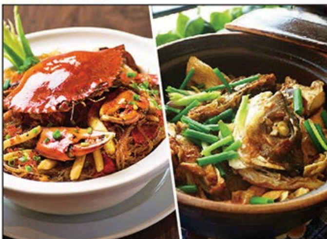
廚師窩燒推介 Casserole Delicacies

Starting from Wednesday, 8 - 31 December