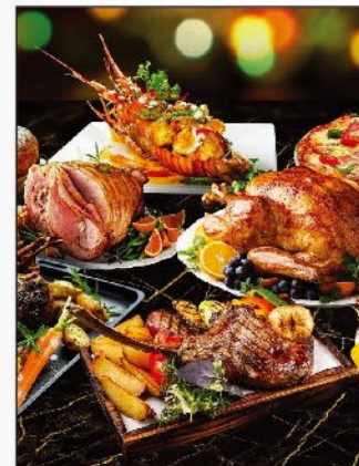
火樹銀花平安夜自助晚餐 暨幸運抽獎 Christmas Eve Dinner Buffet cum Lucky Draw Night