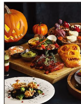
萬聖節半自助晚餐 Halloween Semi-Buffer Dinner