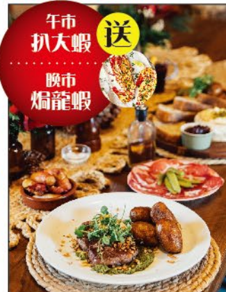
聖誕午餐及晚餐 Christmas Set Lunch & Dinner