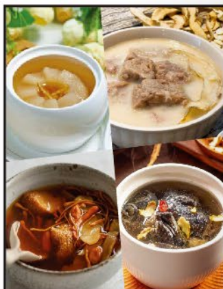
秋冬滋潤燉湯 Nourishing Stew Soup