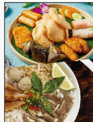
泰越美食推廣 Thai/Vietnam Food Promotion