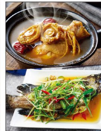
全新創意酒席 Fusion Food Feast

全年預訂供應 All Year Round Advance Order Menu.