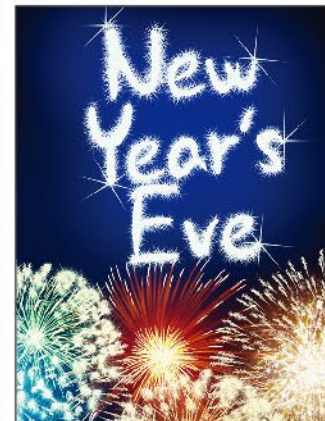
大除夕半自助晚餐 New Year Eve Semi-Buffer Dinner

全年預訂供應 All Year Round Advance Order Menu.