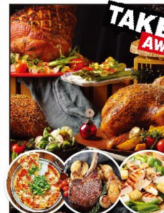
聖誕及新年外賣派對食品 Christmas & New Year Party Take Away Food