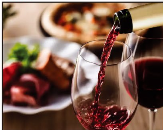
中、西佳餚餐酒晚會 Chinese, Western Cuisine Wine Tasting Dinner