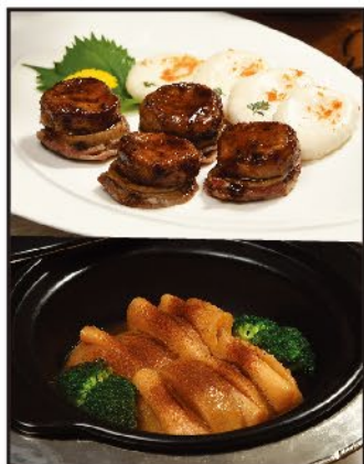
懷舊美食坊 Old Favourite Cuisine