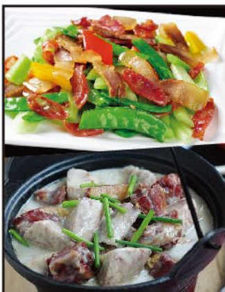
秋冬佳餚篇 Autumn and Winter Delicacies