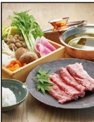
一人一爐自助火鍋 Individual Hot Pot Dinner Buffet