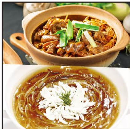
秋冬驅寒三寶 Autumn and Winter Set Menu