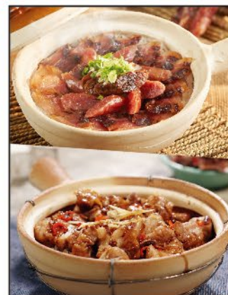
滋味煲仔飯及煲仔菜 Casserole Rice with Delicious Flavor