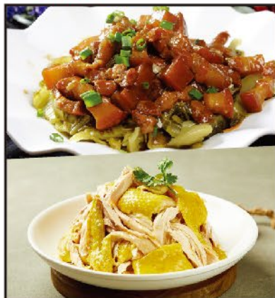
客家美食坊 Hakka Cuisine